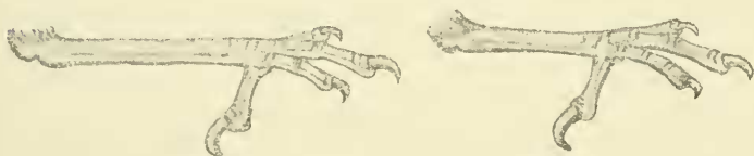
Foot of Trichostoma rostratum .

draw for this purpose. The bird in question is in every other respect a true T. rostratum , though the shortness of the tarsi does not agree at all with the character of the genus, which latter is chiefly based upon the tarsus being half the length of the tail.